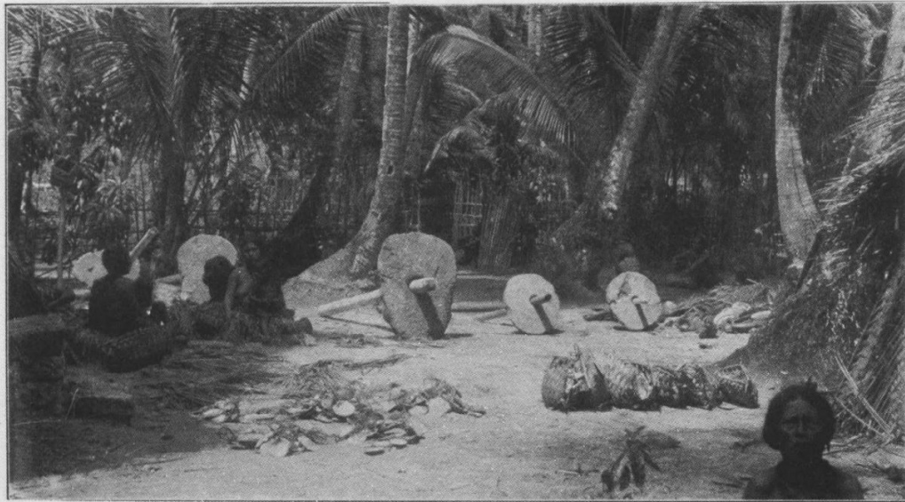
STONE MONEY OF UAP, WESTERN CAROLINE ISLANDS.