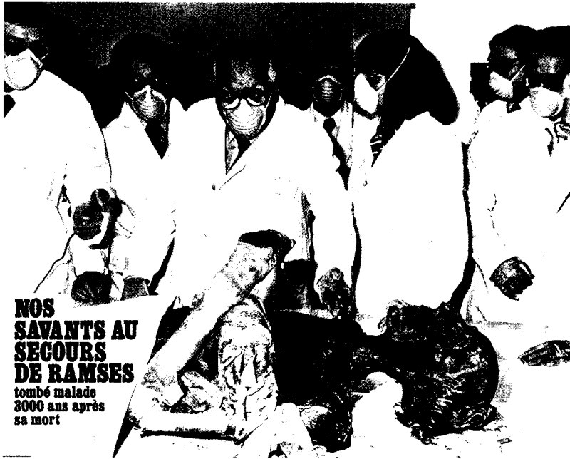
Figure 10.1. Our scientists to the rescue of Ramses II, who fell ill three thousand years after his death. (From Paris Match , September 1956)

the spinal cord that caused extreme pain. Too late for an intervention. But not too late to claim still another triumph for French physicians and surgeons, whose reach has now expanded in remote time as well as in remote space.