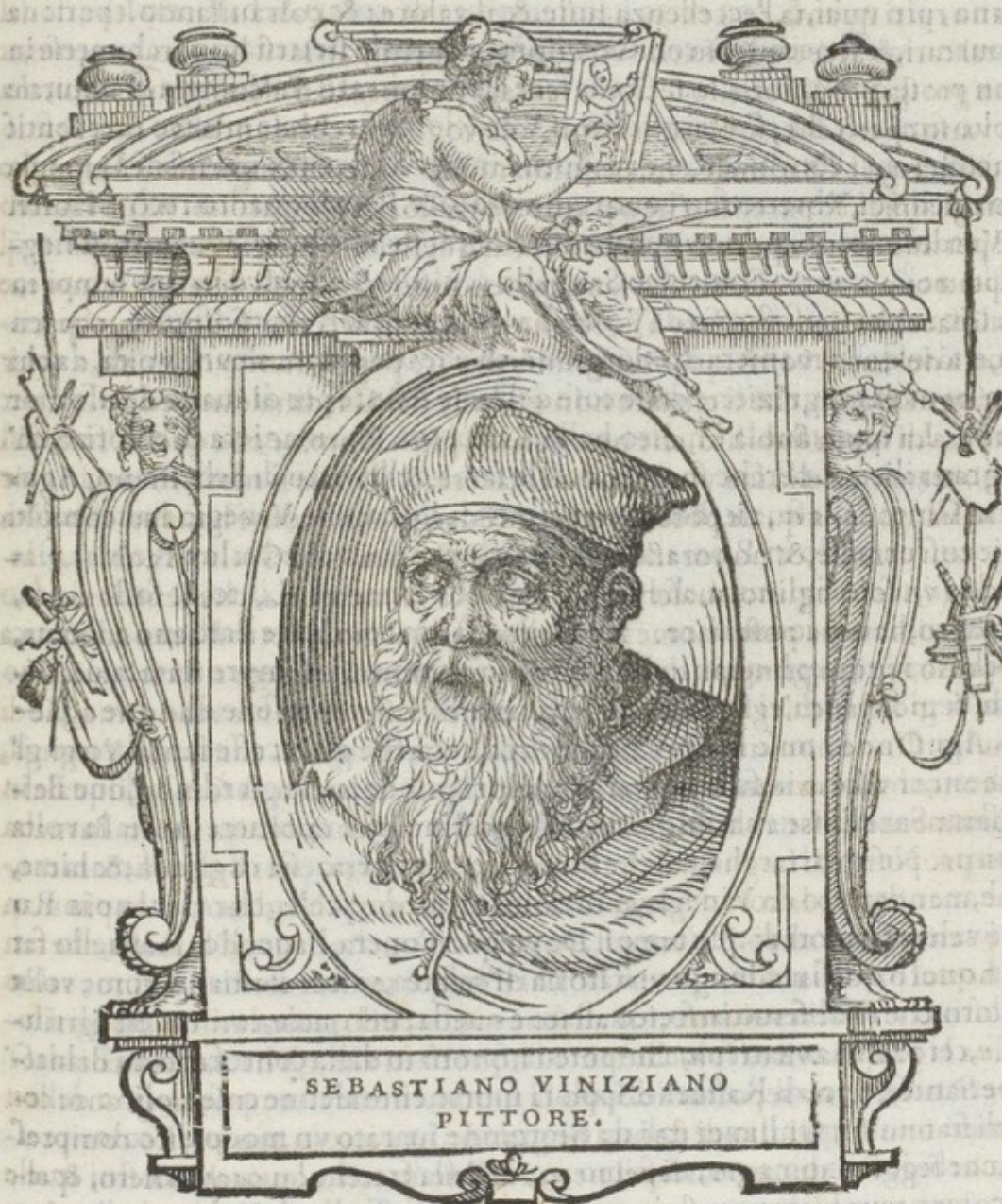
SEBASTIANO VINIZIANO PITTORE.