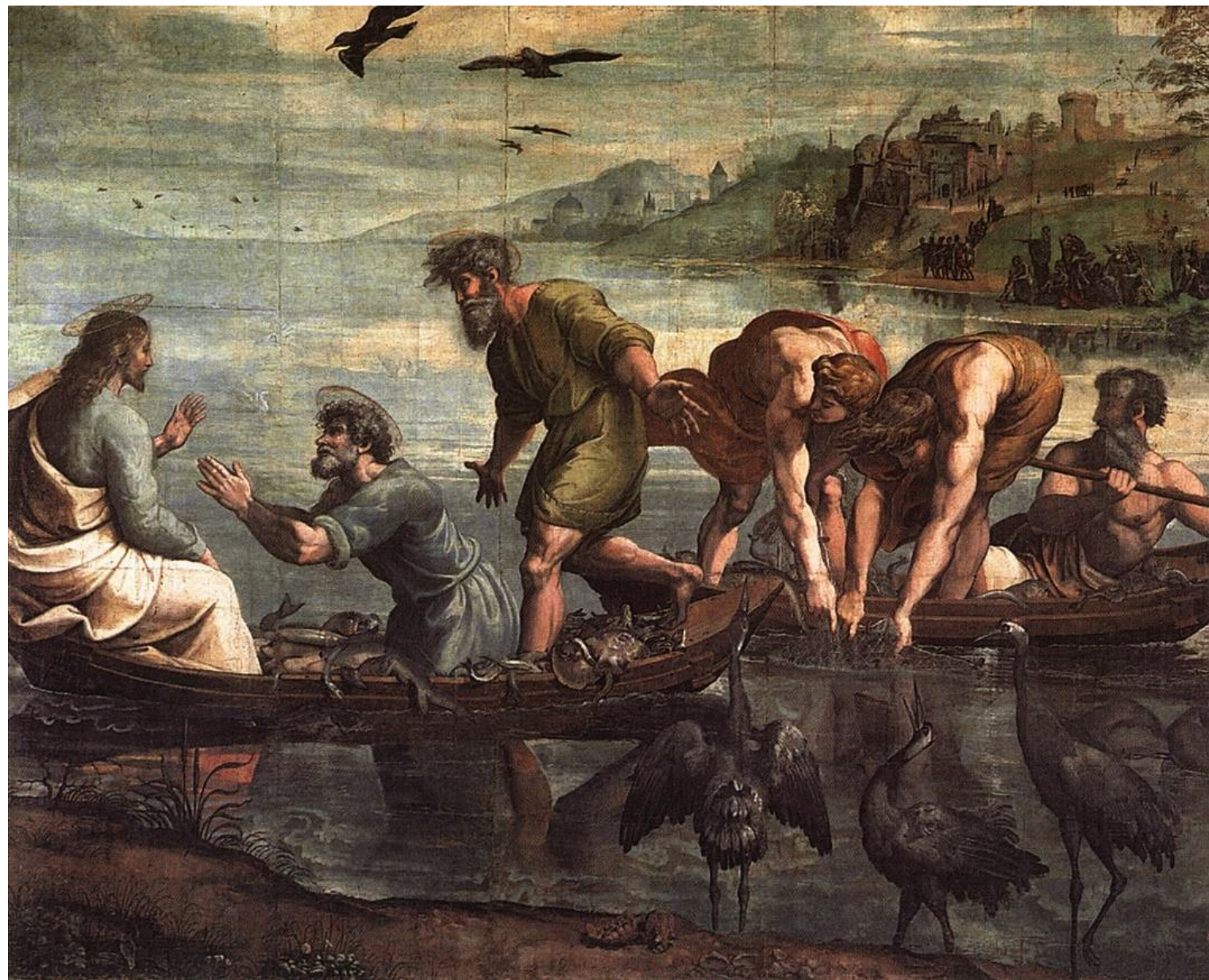
Raphaël et atelier, La Pêche miraculeuse, 1515 -1516, gouache et huile sur carton, Victoria and Albert Museum, Londres (Royaume -Uni)