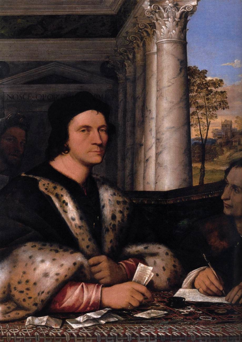
Sebastiano del Piombo Portrait of Ferry Carondelet and his Secretaries 1510-12 Oil on panel, 113 x 87 cm Museo Thyssen-Bornemisza, Madrid