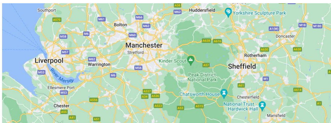
Kinder Scout is a national nature reserve, located in the Peak District National Park, in the North of England. Google map.

3. The 2003 Land Reform (Scotland) Act introduced a right of responsible public access for recreational and other purposes, to land and inland water throughout Scotland, with a few exceptions. The right of access only applies if it is exercised responsibly, and the Code sets out what counts as responsible behaviour in a variety of circumstances.