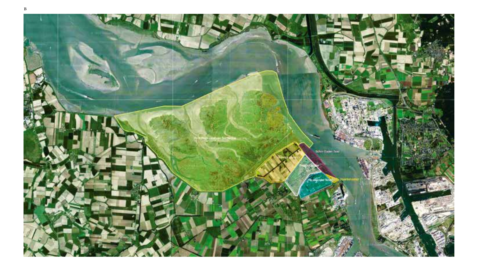
FIGS.: A — New nature at the Port of Antwerp, 2013. B — Arial view of the Great Saeftinghe Cross-border Park and the polders.

offered belittling condolences and ecologists spoke with the tongue of vindication: Had it not been the farmers' Green Revolution that had polluted the land beyond reason? Had the Farmers' Syndicate not dwarfed the Natural Protection Plans from the 1990s onwards?<sup>3</sup> And so, in 2011, it was in an atmosphere of ecological self-righteousness that restoration started. Bulldozers ripped up agricultural land. A handful of farms, hamlets, and landmarks disappeared overnight. Pools and breeding places for birds were then built, where just a few months ago often centuries-old farms had stood. The place looked forsaken in the eyes of those who had lived there, and watching the nesting birds in particular left them with a bitter aftertaste. For these birds had once been their allies.