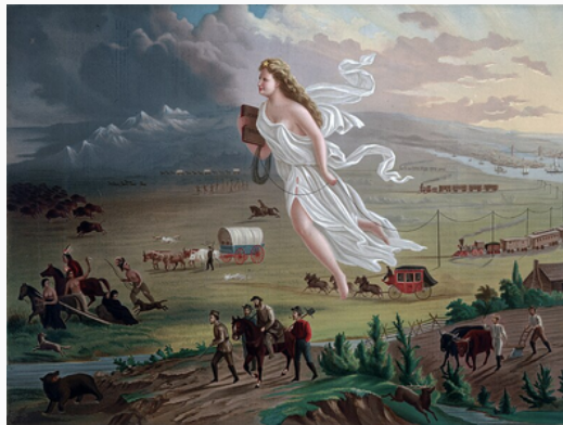
American Progress by John Gast, 1872