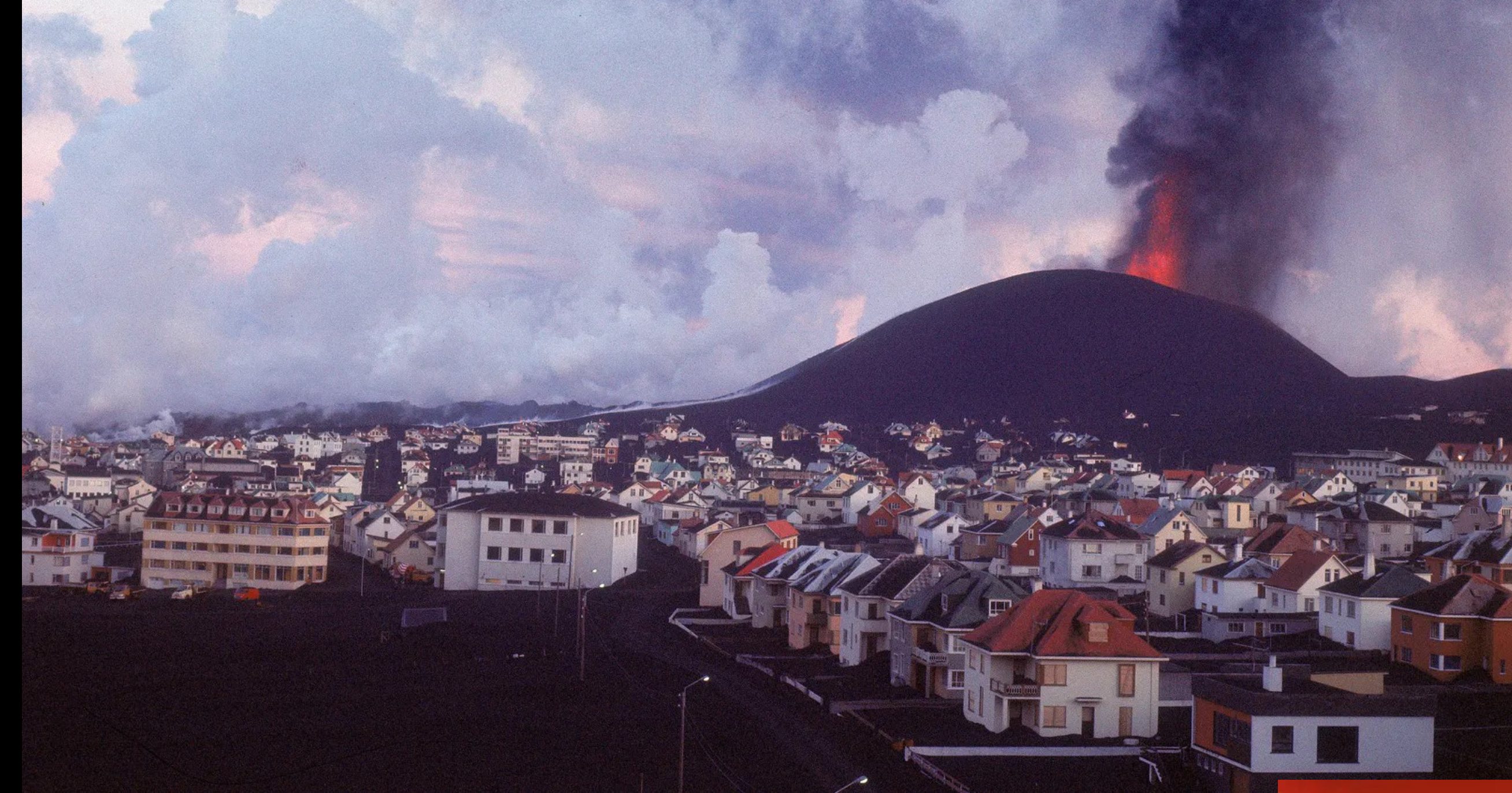
Volcan Eldfell, île de Heimaey