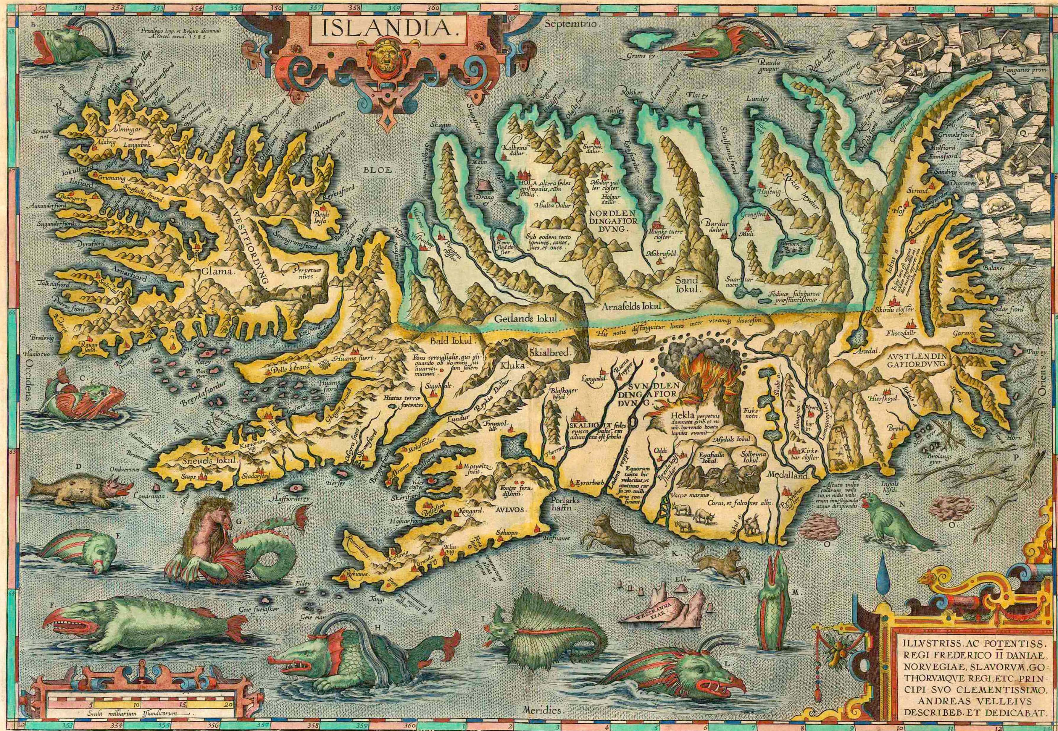
Abraham Ortelius, Islandia , dans Theatrum Orbis Terrarum , 1590