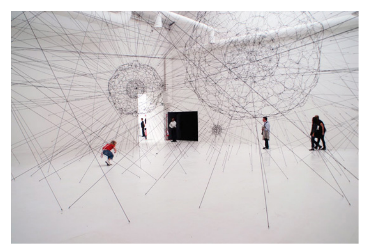
Tomas Saraceno, Galaxies Forming along Filaments, Like Droplets along the Strands of a Spider's Web, 2009.

possibility of having an envelope around a local habitat is given by the length, number, and solidity of the connectors that radiate out in all directions. I would have loved to see, when the exhibition was dismantled, how quickly the spherical patterns would have collapsed once a few of their outside links had been severed. A powerful lesson for ecology as well as for politics: the search for identity "inside" is directly linked to the quality of the "outside" connection — a useful reminder at a time when so many groups clamor for a solid identity that would "resist globalization," as they say. As if being local and having an identity could possibly be severed from alterity and connection.