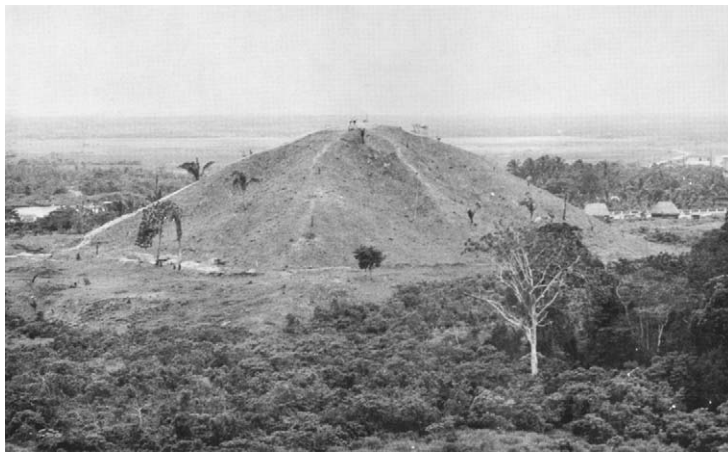
FIGURE 2. Aerial view of the La Venta pyramid.

The object of their investigation was the earthen pyramid, known as Complex C, that stands at the center of the La Venta site (fig. 2). The pyramid had for years been covered by a thick layer of vegetation and had received little attention during previous excavations, which were more concerned with recovering colossal statuary and determining the ceramic sequences of the site. The clearing of this vegetation and uncovering of the pyramid over the course of Heizer’s 1967 excavations had led to a slew of articles on the “New World’s Oldest Pyramid,” a “‘gelatin-mold’ pyramid” (or