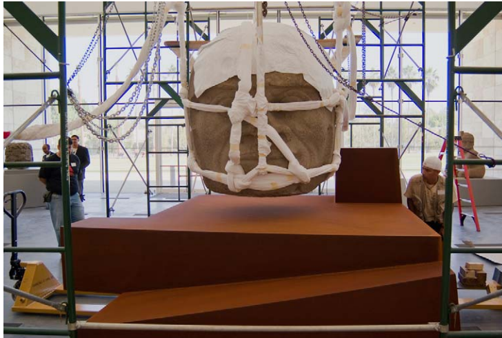
FIGURE 1. Installation photograph from the exhibition Olmec: Colossal Masterworks of Ancient Mexico at the Los Angeles County Museum of Art (October 2, 2010–January 9, 2011).

that began as soon as the Olmec were rediscovered in the early twentieth century. Heizer had been asked to build these supports as part of a larger effort to promote synergies across the museum's modern and ancient offerings, but more importantly as a means of acknowledging a peculiar coincidence of lineage. His father, Robert Heizer, was an archaeologist who investigated the Olmec site of La Venta for two decades. 2