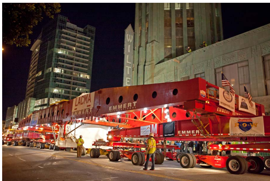
FIGURE 6. The transportation of the boulder for Heizer's Levitated Mass through the streets of Los Angeles.