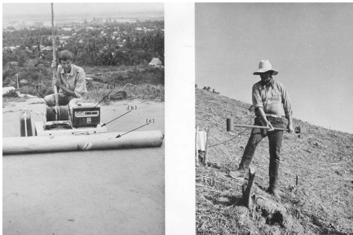
FIGURE 3. The experimental circuit of the La Venta magnetometer survey.

Prior to their return to La Venta, the scientists had to develop a computer model to predict how buried monuments might manifest in their magnetic readings as well as a circuit of scientific instruments capable of sensing these predicted variations in the pyramid's magnetic field. 27 To assemble this technological circuit, they turned to the latest products of Hewlett-Packard and one of the first major Silicon Valley tech companies and developer of many Cold War military technologies, Varian Associates. The instrumental circuit used to complete the survey in May of 1969 actually comprised two magnetometers, each with their own coupler, connected to a Hewlett-Packard counter, a power supply, and a gasoline generator (fig. 3). With one magnetometer serving as a baseline reading of the "regular" magnetic field of the pyramid, the other magnetometer and its 600-foot cord were dragged up and down the pyramid in search of variations and anomalies. The data from these two readings, fed through the couplers to yield an oscillating ratio on the Hewlett-Packard monitor, offered a means of charting a fluctuating energetic field otherwise invisible to the scientists. 28