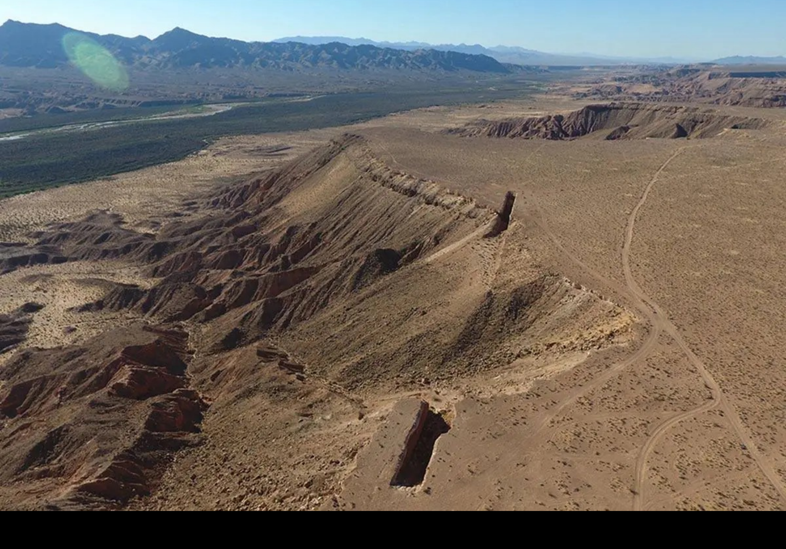
Michael Heizer, Double Negative, 1969