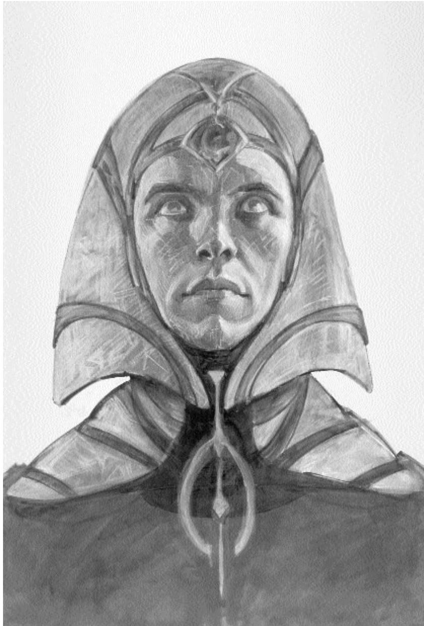
Figure 3: Original design for Mace Windu, using the face of Industrial Light and Magic modeler Steve Alpin. Original Art by Iain McCaig