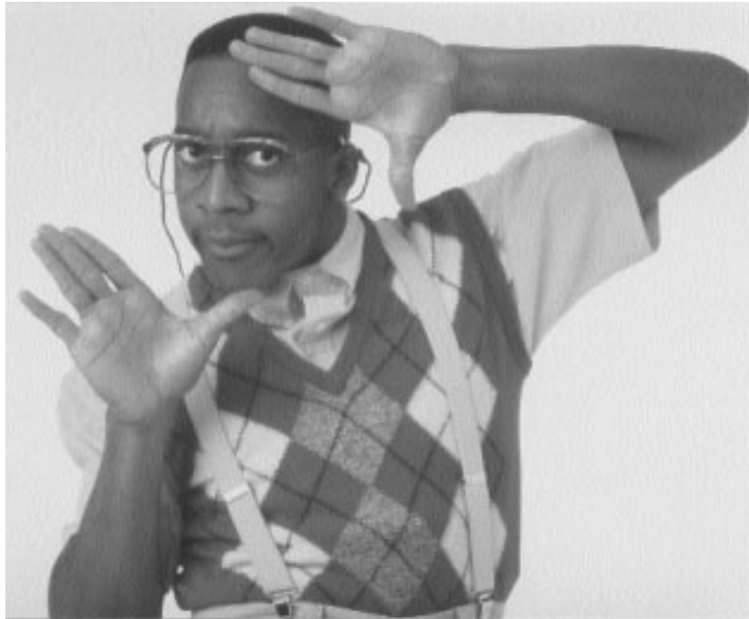
Figure 2: Jaleel White playing Steve Urkel in Family Matters . Warner Bros.

(135). “When [Jackie Robinson] played . . . no game ended without my refiguring his average up through his last turn at bat” (179). “Allah taught me mathematics” (quoting Elijah Muhammad, 237). “[The University of Islam] had adult classes which taught, among other things, mathematics” (240). And in a television interview, his explanation for the new surname: “X stands for the unknown, as in mathematics.” By invoking the abstract rationality of math, Malcolm stood in shocking contrast to primitivist expectations of white America.