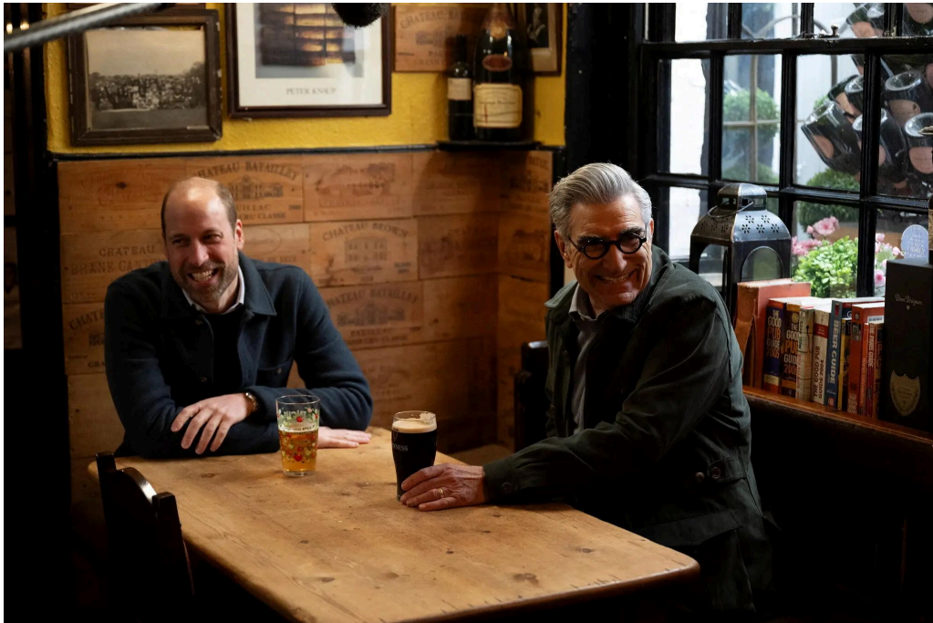
A photograph released by Apple TV+ showing Prince William with the Canadian comic actor, Eugene Levy as part of Mr. Levy's Apple TV+ series, "The Reluctant Traveler."