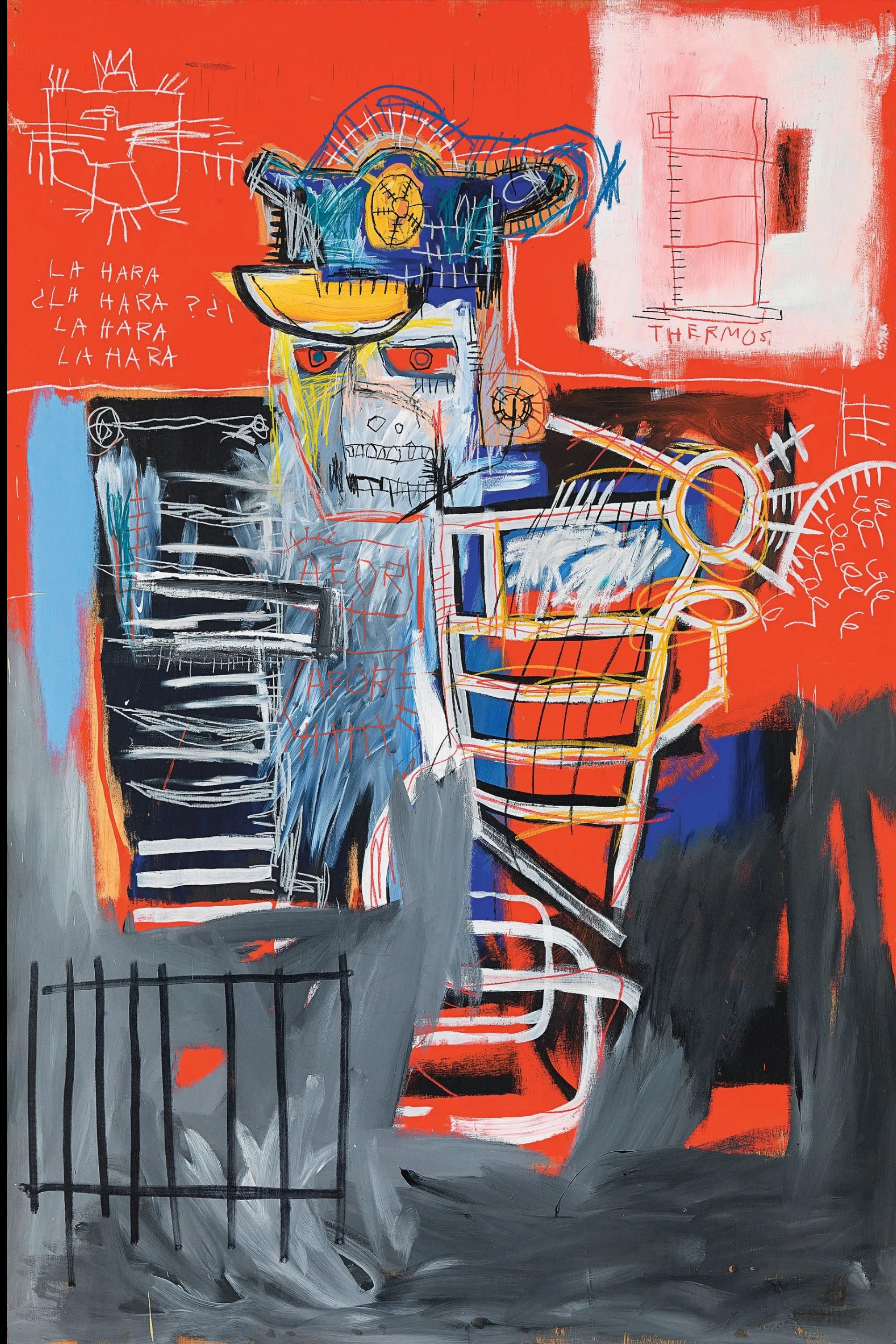
Basquiat, La Hara , 1981