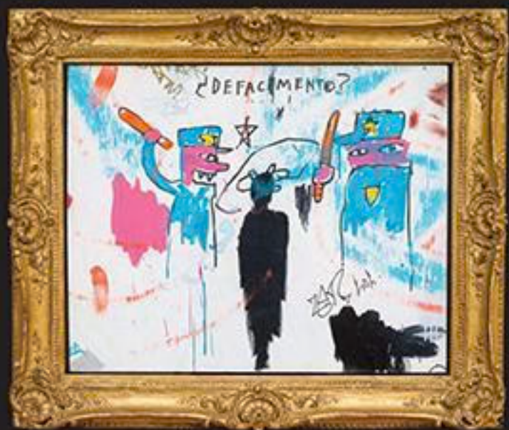
BASQUIAT'S DEFACEMENT THE UNTOLD STORY