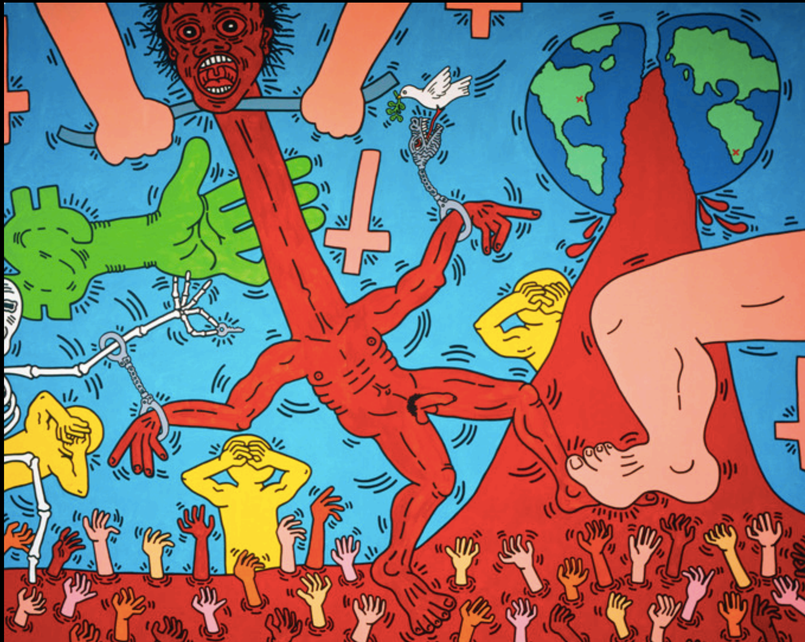
Keith Haring, Michael Stewart – USA for Africa , 1985