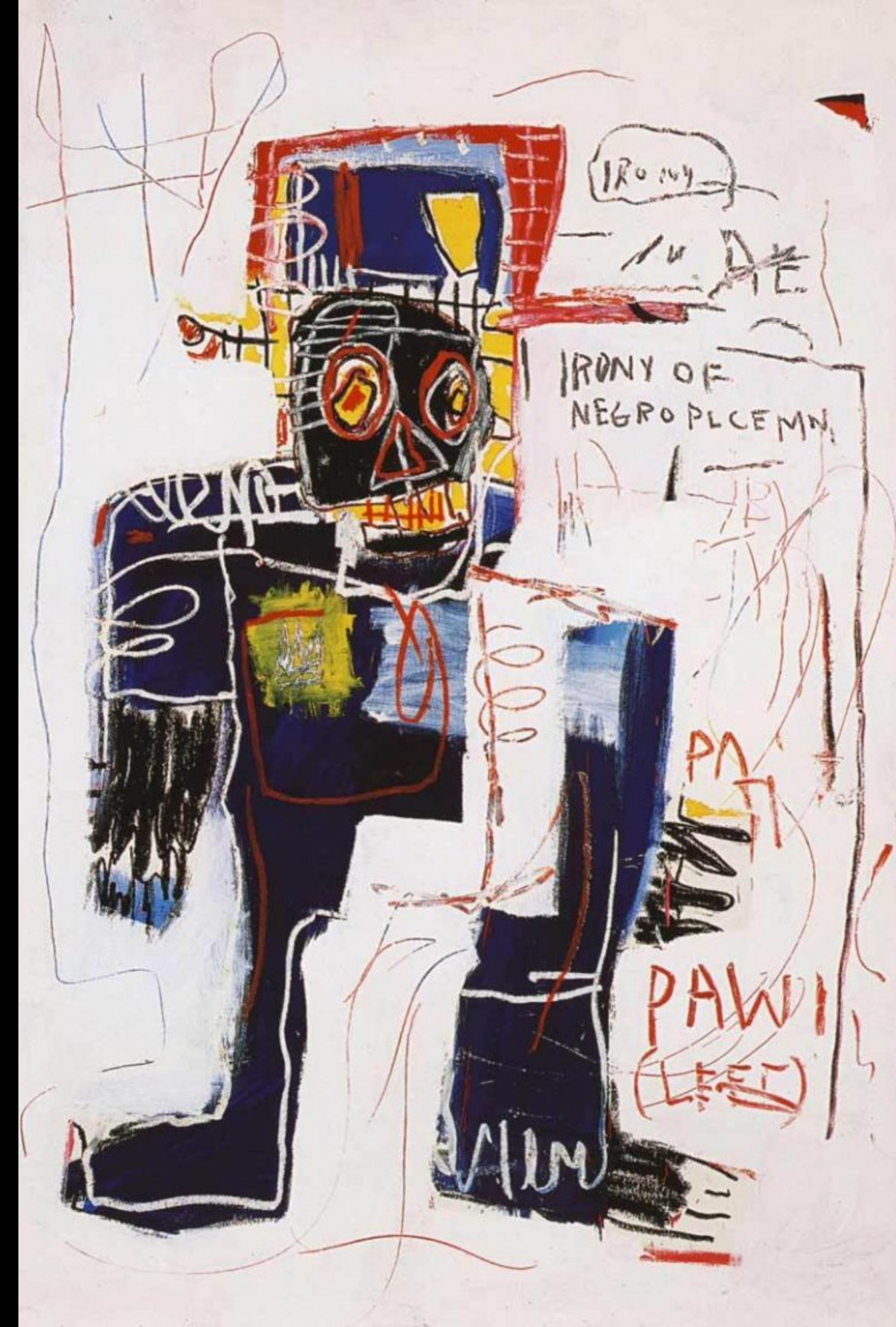
Jean-Michel Basquiat, Irony of a Negro Policeman , 1981