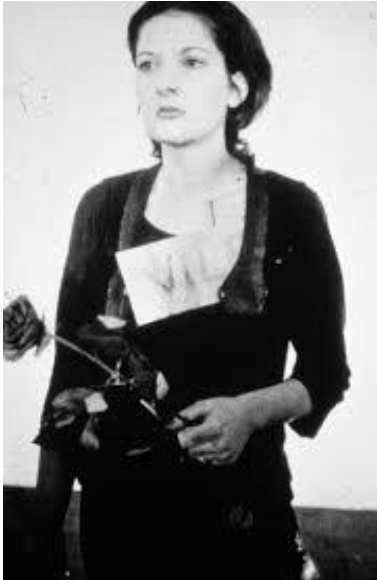
Rhythm 0: Marina Abramović. 1974